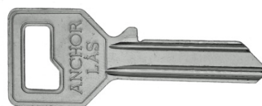
Keyblank 350 RECT GRIP